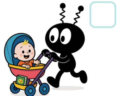
Stroll with Baby Outdoors