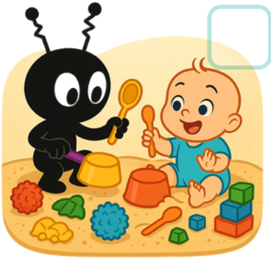
Play with Sensory Objects