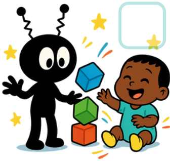
Baby Build: Play with stacking toys or soft Blocks

Track Programs attended or complete fun small literacy based activities to earn virtual tickets on beanstack for a chance at the Grand Prize!