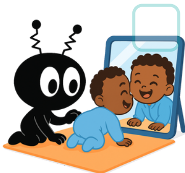
Play with a Mirror