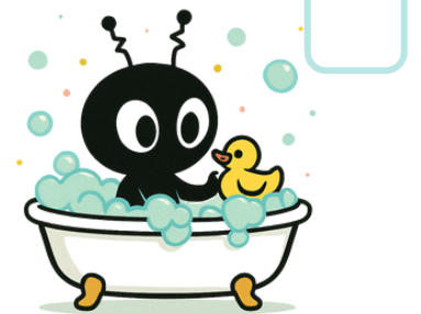
Play While Bathing