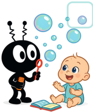
Play with Bubbles