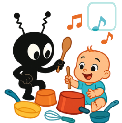
Make Music with Your Baby