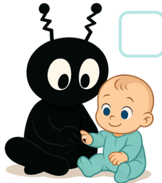
Play with Baby in Your Lap