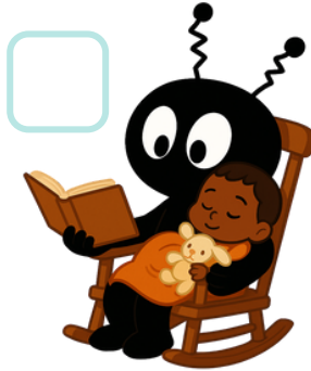
Read Before Naptime