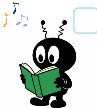
Sing a Book