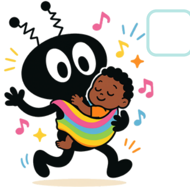
Dance with Your Baby