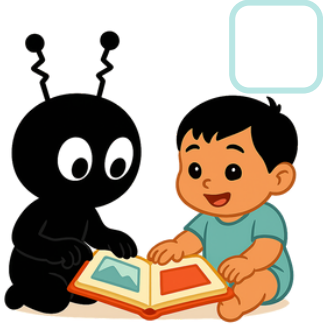
Share Family Photos with Your Baby

Track Programs attended or complete fun small literacy based activities to earn virtual tickets on beanstack for a chance at the Grand Prize!