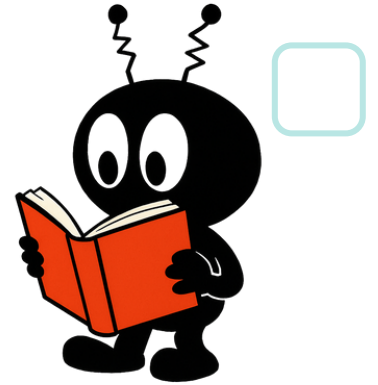
Read A Book About Colors Aloud