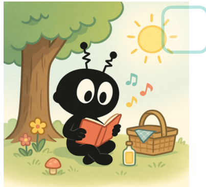
Read outside with Baby