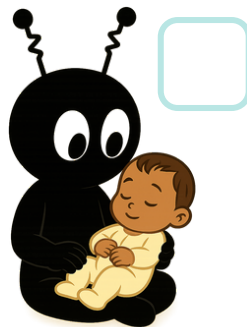
Attend 1 or more Mommy & Me Programs