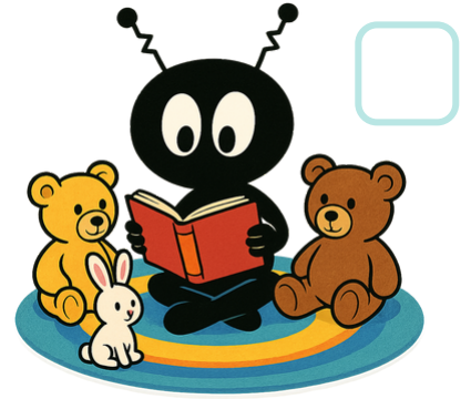
Attend 1 or more Baby Storytimes.